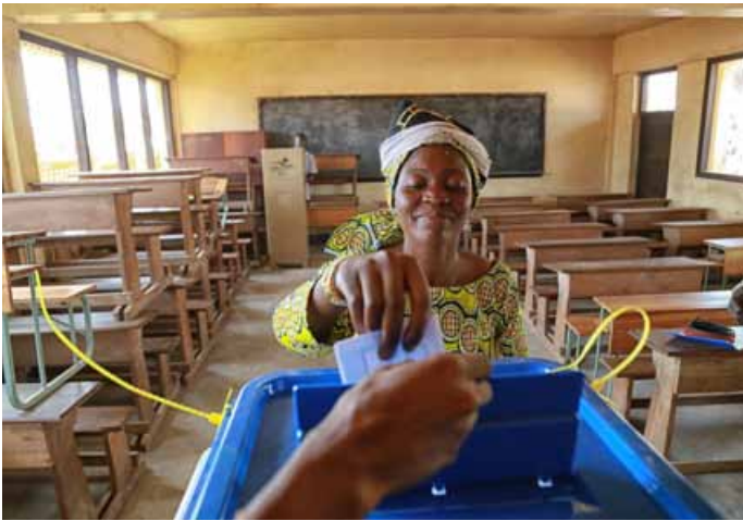
A woman casts her ballot in the Central African Republic during the referendum, UN Photo/Nektarios Markogiannis