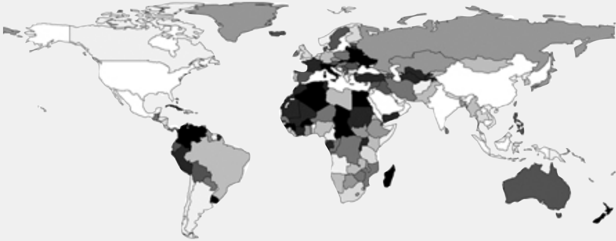
Figure 3. The darker the shade of grey, the higher the DDPP country score.

ent on the complex relationship of these components. For example, in some countries triggering a popular vote is easy, but nevertheless the potential for direct democracy is low due to participation quorums. This problem has been particularly acute in Eastern Europe (Altman 2016). In other countries, such as Switzerland or Australia, double majorities of cantons or states are required for certain types of mechanisms of direct democracy be approved. Similar situations occur with approval quorums or super-majorities, although these qualifications are much less used and extended than the former ones.